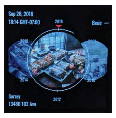
Figure 3: The Chronoscope UI visualizes the central photo's location in time and provides corresponding data around it.

curiosity, contemplation, and exploration. Yet, engaging in the design of this device did produce challenges, particularly in terms of balancing the sheer quantity of data captured in a person's personal digital photo archive with our goal of supporting open-ended and temporally diverse interactions through and across time. Such issues and experiences we encountered through our design process provoked us to critically consider how designers interested in making technologies that manifest data in temporally diverse forms that can support open-ended (versus goal-directed) experiences over time could be better supported in the future. It is these insights that emerged through the design of Chronoscope that we reflect on in this paper.