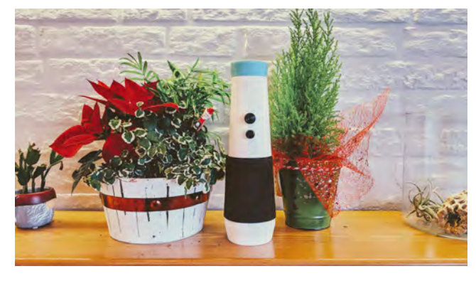
Figure 1: Leveraging the metadata of each digital photo, Chronoscope is a tangible device that enables interactions through and across time in one's personal photo archive.

DIS '19, June 23–28, 2019, San Diego, CA, USA © 2019 Copyright is held by the owner/author(s). Publication rights licensed to ACM. ACM 978-1-4503-5850-7/19/06...$15.00 https://doi.org/10.1145/3322276.3322301