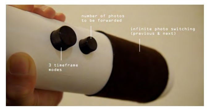
Figure 6. Three physical controls used to select viewable photo, timeframe mode, and to tune the temporal granularity.

that this is an interesting and important temporal interaction feature because it is quite different from typical or traditional interaction design practice – the idea of replacing all the surrounding data elements of the entity being viewed to indicate a timeframe mode change, rather than changing the core entity itself. While nuanced, this subtle feature proved to enrich the interactive experience with Chronoscope, which we elaborate on more next.