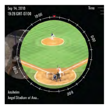
Figure 5: The evolution of the Chronoscope user interface. During the first iteration with the Processing app, we listed the metadata text of time of day and date into two different rows (see upper left) that incidentally revealed intriguing ways to apply and structure metadata in our second iteration (bottom left). The final design shown in Figure 3 is modelled after iteration 2.

navigating digital photos appeared intuitive – rotating clockwise implicitly suggested moving 'forward' in time (closer to the most recently taken photo), while rotating counter-clockwise moved 'back' in time. A continuous rotational interaction also appealed to us because it was extensible; as one's photo archive grew, it only required more rotations to navigate it. Conceptually this meant we could support a boundlessly growing archive without a mechanical 'endpoint' blocking navigation once a terminal size of the photo archive had been reached. (although practically this created other design issues that we had to overcome as described later).